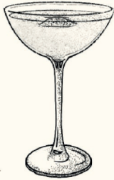
Bergamot Daiquiri Nusa Caña White Rum, Italicus, Lime, Jasmine Tea Cordial 11