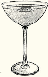
Cosmopolitan Bonomi Vodka, Cointreau, Lime, Cranberry Juice 11