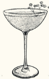
Elderflower 75 St Germain Elderflower Liqueur, Grahams White Port, Citric, Champagne, Lemon Oil 12