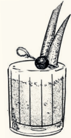
Pineapple & Spiced Clementine Rum Sour* Diabliesse Spiced Clementine Rum, Takamaka Zannannan, Lemon, Fabbri Amarena Cherry Syrup, Vanilla 11